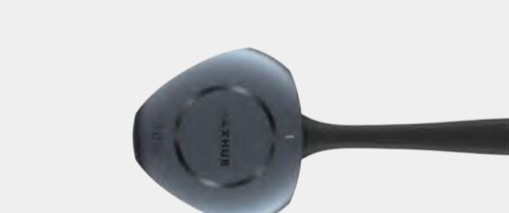
Wireless Dongle (WT13)