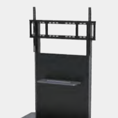
Mobile Stand (ST23C)