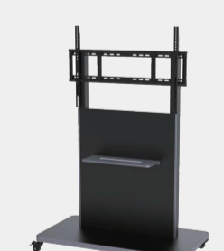
Mobile Stand (ST23C)